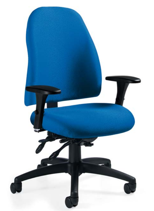
4434 Medium Back Multi-tilter. Wide seat and back shown with standard height / width adjustable G3 arm